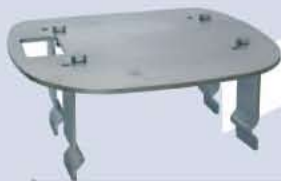
ACG8108 BASE PLATE for K500