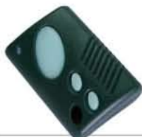
HANDSET TM305B (requires use in conjunction with stand alone 315Mhz receiver)

Australian Offices International Manufacturers and Licensees