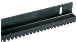
ACS9040 Module 4 RACK in iron (sect. 22x22mm) with right-angle member (up to 2200 kg) in 2 mt bars