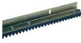
ACS9000 Module 4 RACK (sect. 25x22mm) in Nylon with right-angle (up to 1000 kg) in 1mt bars ACS9001 Set 10 m