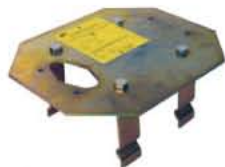
ACG8107 BASE PLATE